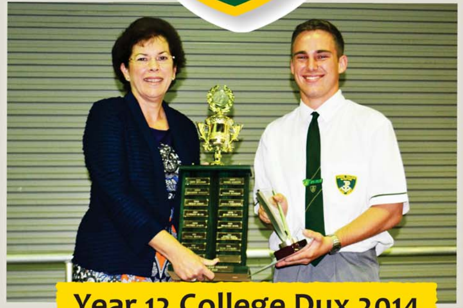
Year 12 College Dux 2014