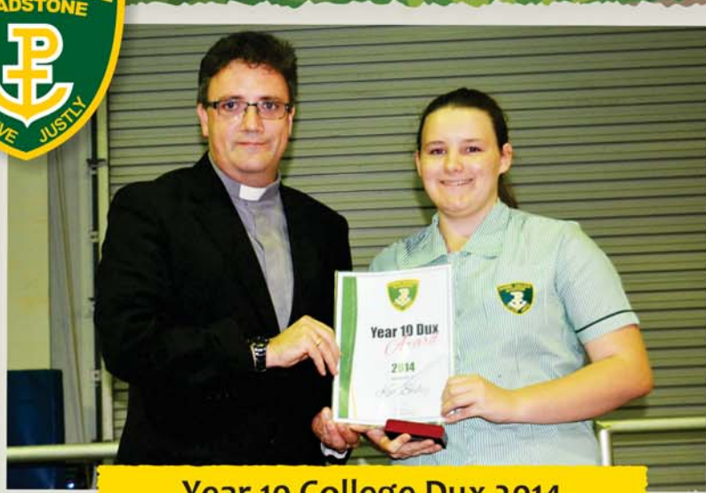
Year 10 College Dux 2014