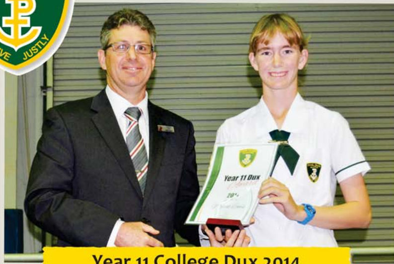
Year 11 College Dux 2014